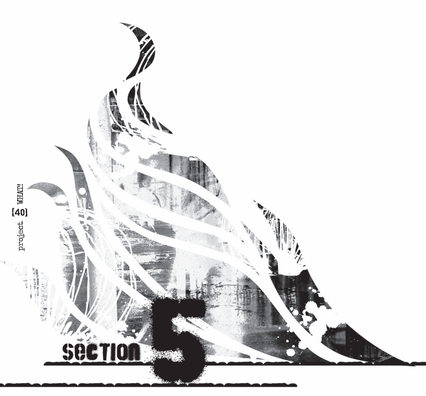
Making Something Positive Happen in My Life